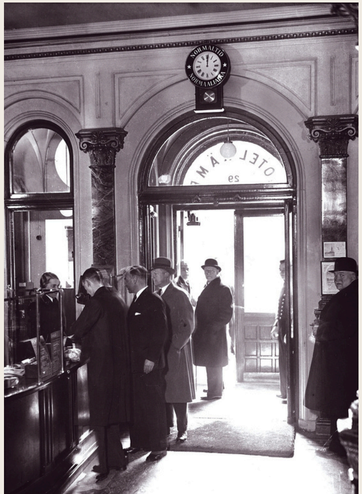
Top: Hotel Kämp xxxx by Lorem Ipsum, lorem e dolores e xxx,xxx, xxx at Ala Kämp in 1910, Dinner at Mirror Room in 1956, Kämp reception in xxxx.